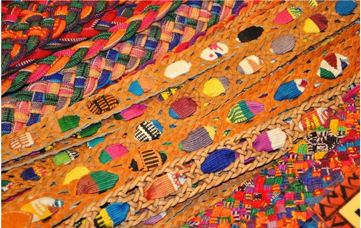
Belts for sale at Villagefest

On Thursday evenings, downtown Palm Springs comes to life with more than 180 vendors set up in the streets for VillageFest. Palm Canyon Drive is closed to traffic, and booths are set up along both sides of the street. This is a fun evening out, where you can shop for arts, crafts, jewelry, and other interesting trinkets and try some tasty snacks from local restaurants and stores. Musical performers, buskers, and other acts provide additional entertainment. The event starts early in the evening, around 6 or 7pm, depending on the season, and runs until 10pm.