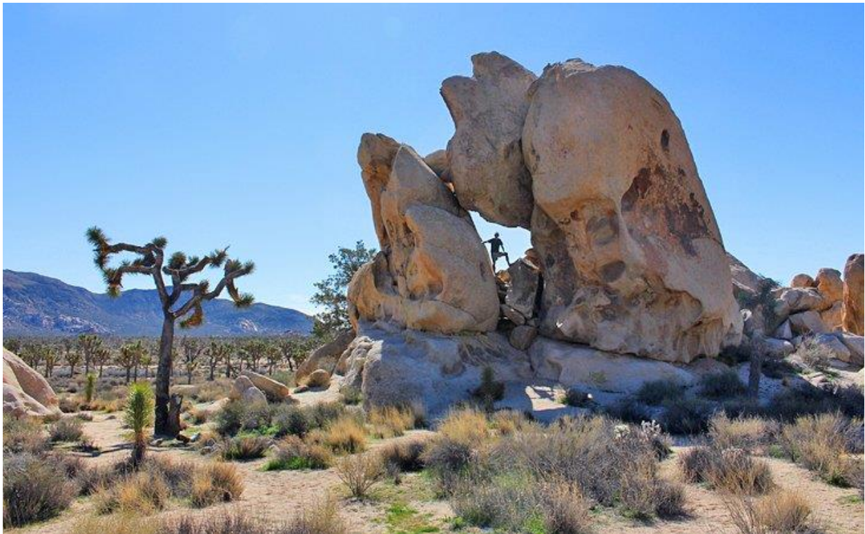
Joshua Tree National Park

Official site: https://www.psmuseum.org/architecture-design-center/