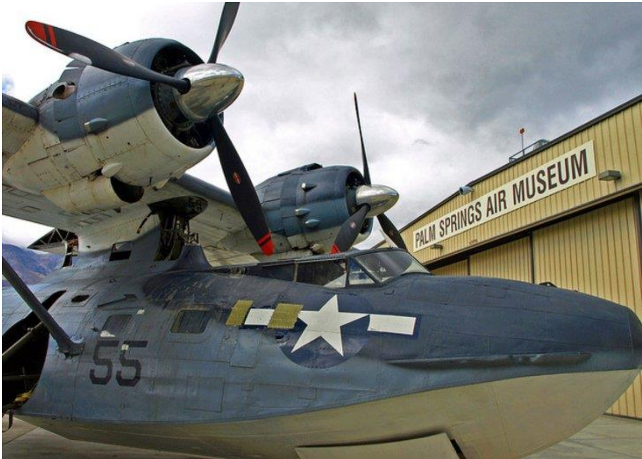
Palm Springs Air Museum

The Palm Springs Air Museum is known for having one of the country's largest collections of working Second World War period aircrafts. Despite this, the museum is quite compact and can be explored easily in a relatively short period of time. Much of the collection is displayed in hangars, so it's a great place to visit when the weather is too hot to be outside or if you're looking for an escape from the outdoors.