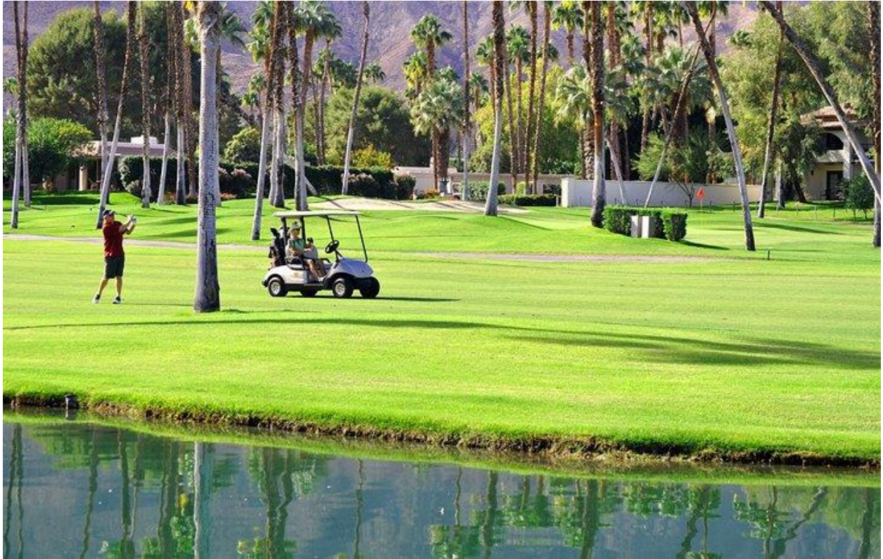
Golf course in Palm Springs

Palm Springs and nearby Palm Desert have some lovely golf courses, and during the winter months, when temperatures are perfect for a round of golf, tourists flock to the area on golf vacations. The courses are extremely scenic, with arid mountains rising in the distance beyond the green fairways that contrast starkly with the surrounding desert. Courses range in quality and price, but some of the top names for public golf courses in the area include Indian Canyons Golf Resort, Escena Golf Club, Desert Willow Golf Resort, Marriott's Shadow Ridge , and Classic Club.