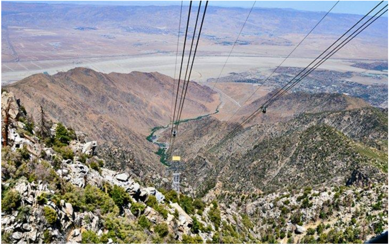
Palm Springs Aerial Tramway and Mount San Jacinto

Standing on the edge of Palm Springs, Mount San Jacinto rises more than 10,000 feet above the desert floor and can be easily accessed with the scenic Aerial Tramway, the world's largest rotating aerial tram car. The view out over the desert is fantastic, and on hot days the cool air at the top can be a refreshing treat.