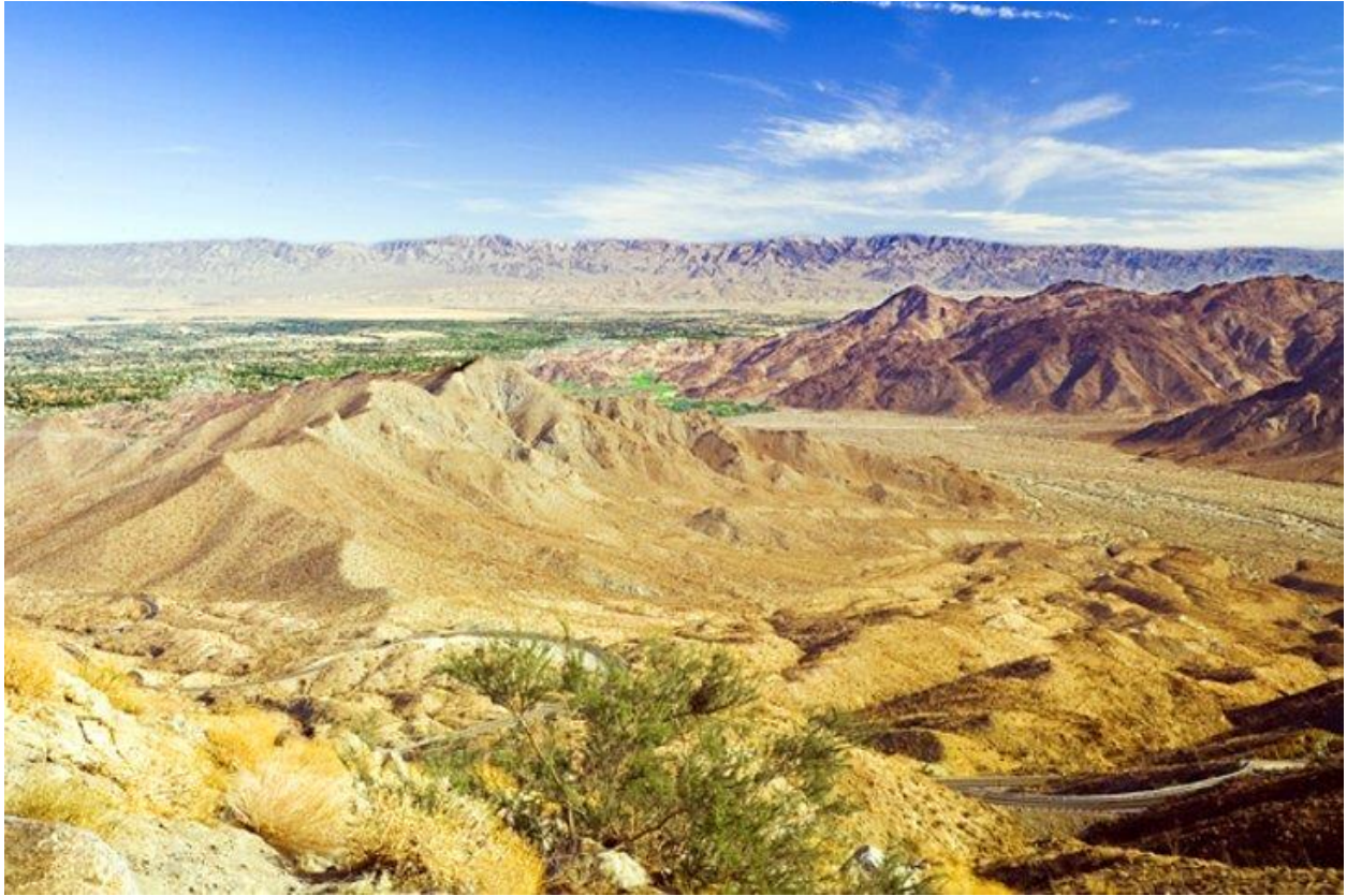
Coachella Valley Preserve

East of Palm Springs, the Coachella Valley Preserve is another wonderful natural area to explore in the Palm Springs area. The preserve covers 13,000 acres of desert landscape and is home to a variety of wildlife, including great horned owls, lynx, hares, kestrels, lizards, snakes, and all kinds of small birds. Guided hikes by volunteers are a great way to see the preserve and offer an excellent overview of the area. If you are just looking to enjoy some tranquility, you can also tackle one of the self-guided hiking trails.