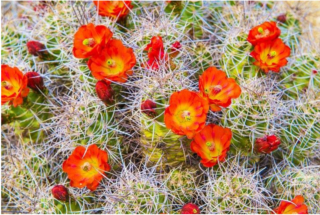
Mojave mound cactus

Moorten Botanical Gardens offers an incredible display of cacti and desert plants that range from full grown trees to plants just taking root. In the spring, when the desert is coming into bloom and trees are starting to turn green again, the gardens are at their best. The facility is open year-round but during the cooler months, from fall until spring, you can take a guided tour of the facility offered free with admission.